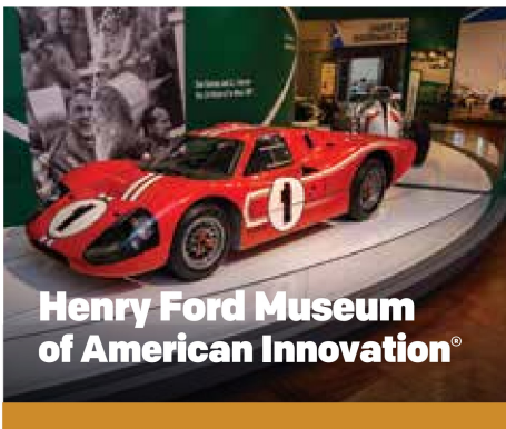
Henry Ford Museum of American Innovation®